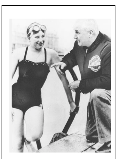
Figure 2 : Body fat offers buoyancy and thermal insulation, important assets for long-distance swimmers such as Marilyn Bell, who crossed both Lake Ontario and the English Channel.

was on average 3.3 times greater in water than in air. Such differences are probably even greater for active individuals. since thev disturb the film of water or air in immediate contact with the skin surface. Subcutaneo us fat has indeed been